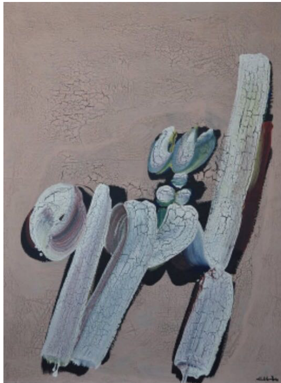
Hamed Abdalla, Al-Thawra Revolution, 1968, mixed media on canvas, 130 x 97 cm

Press preview Monday 9 March from 11 a.m. to 1 p.m.