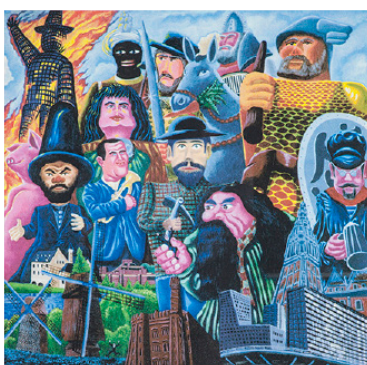
Herve Di Rosa, Untitled , 2003, 108 x 77 cm Lithograph EA 26/30 Courtesy Association for Modern and Contemporary Art in Palestine

While the collection was being enriched, the search for a land on which to build the future Museum began. Following the same approach as for the creation of the permanent collection, namely the principle of solidarity, initial contacts with major architects have been established to consider the form of their contributions. These first contacts have been positive and encouraging.