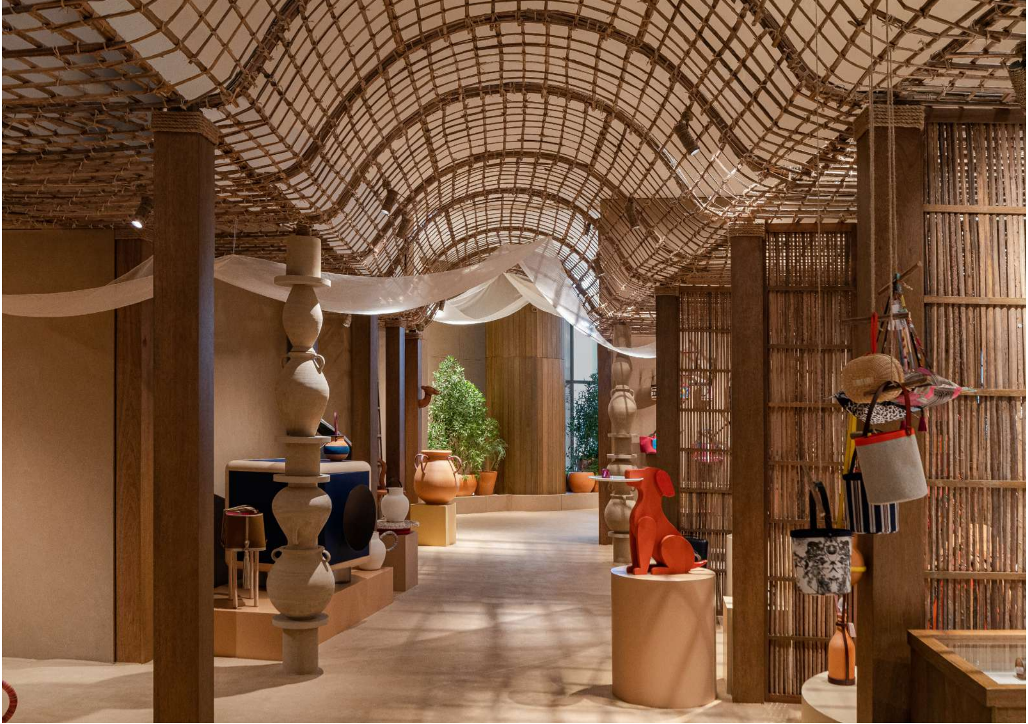
Project created for © Petit H - Hermès All creations are © Petit H - Hermès