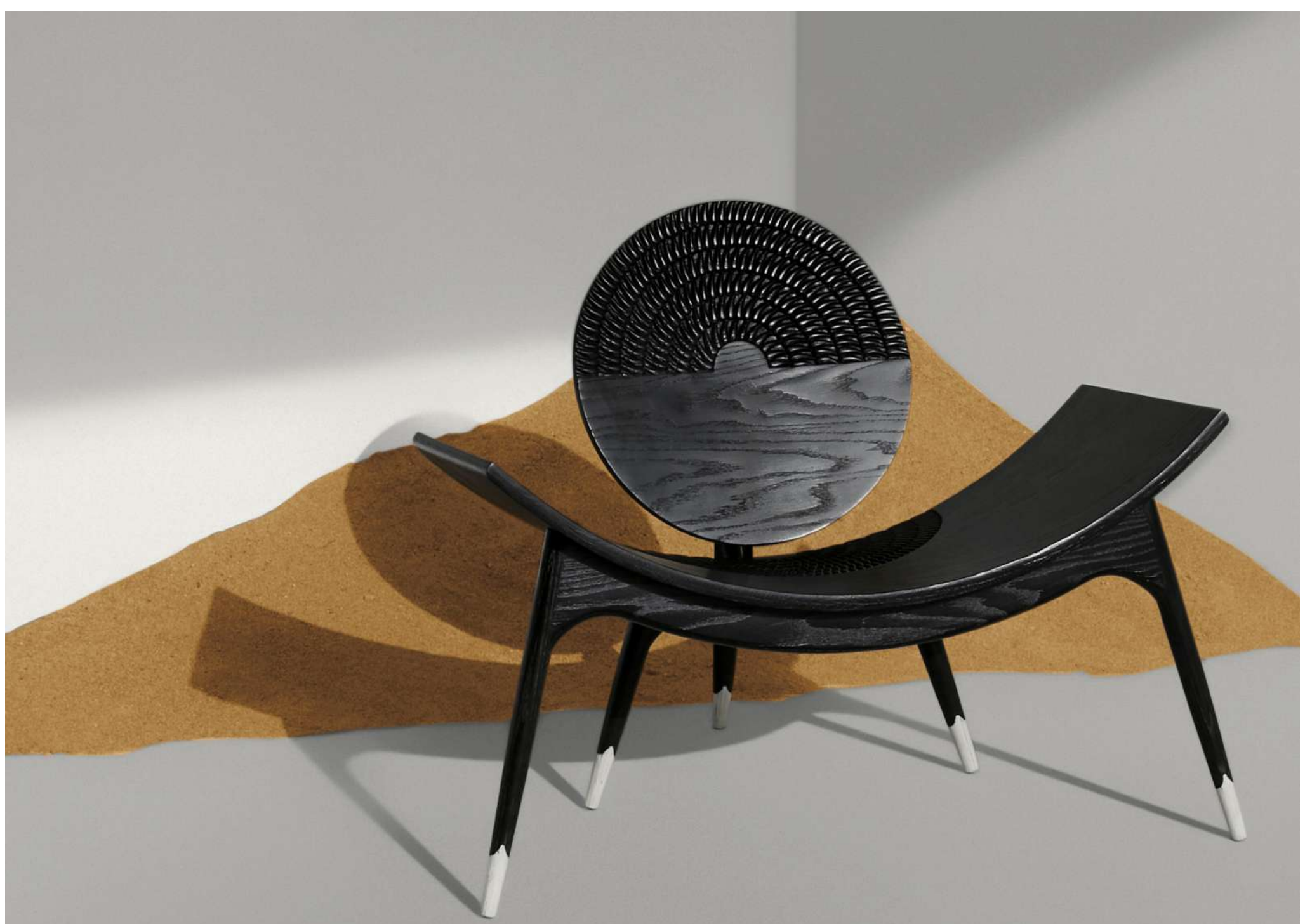
\ensuremath{\texttt{©}} Don Tanani, The duality collection