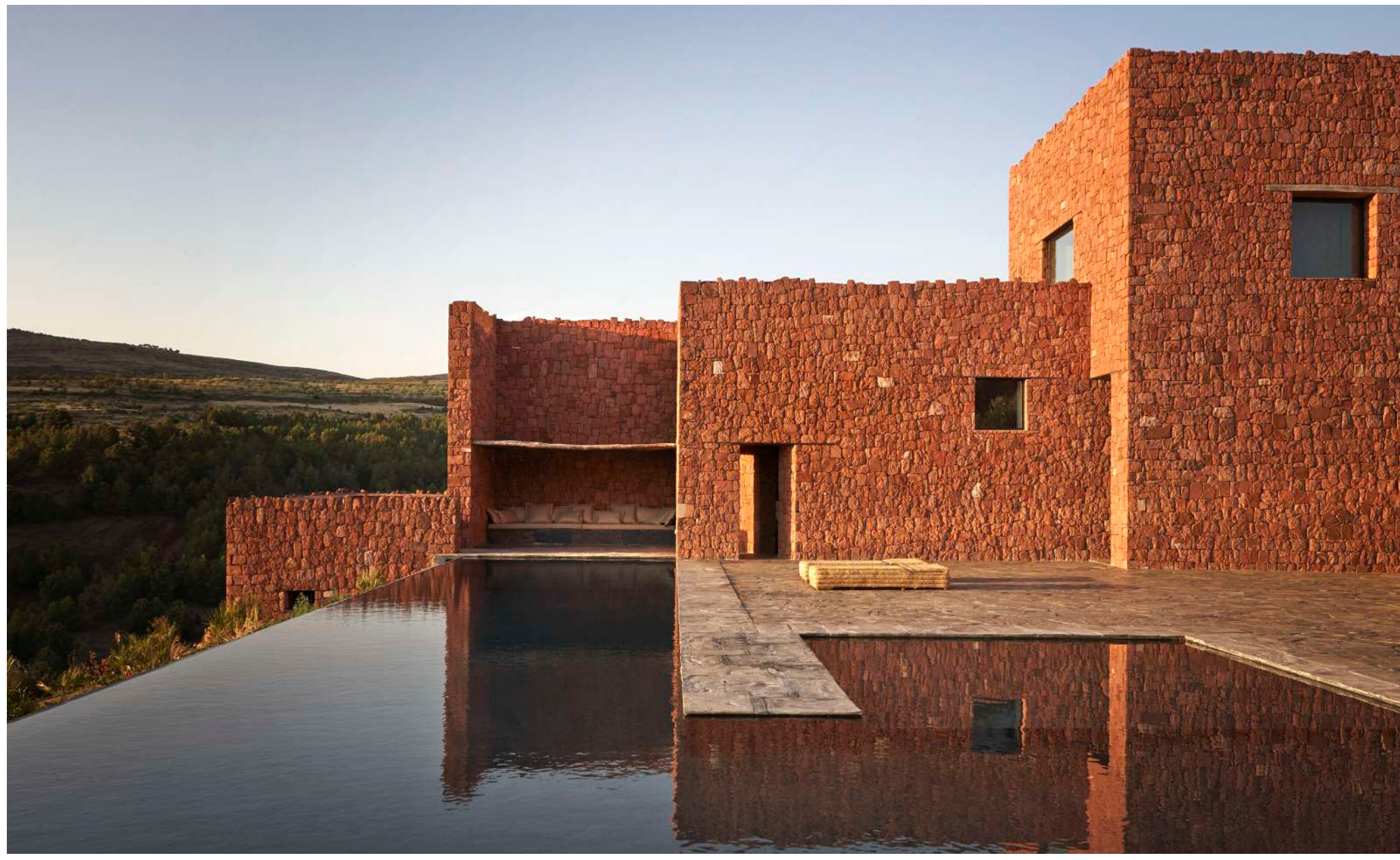
VILLA E