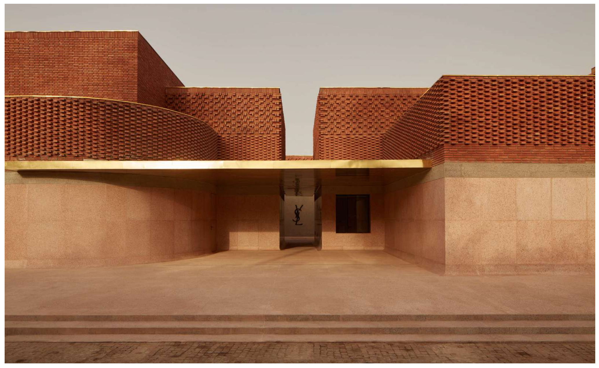
Musée Yves Saint Laurent