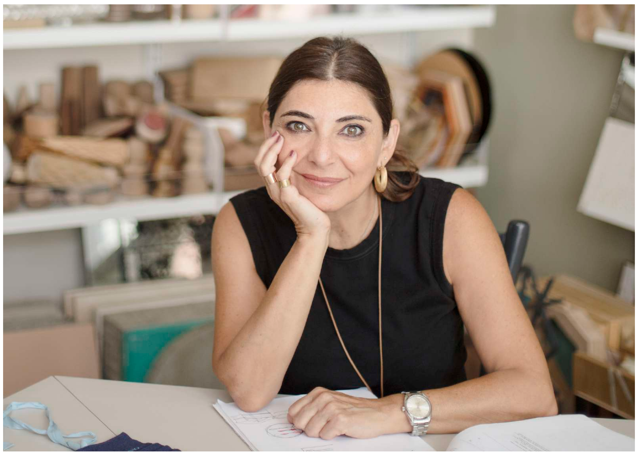
Nada Debs